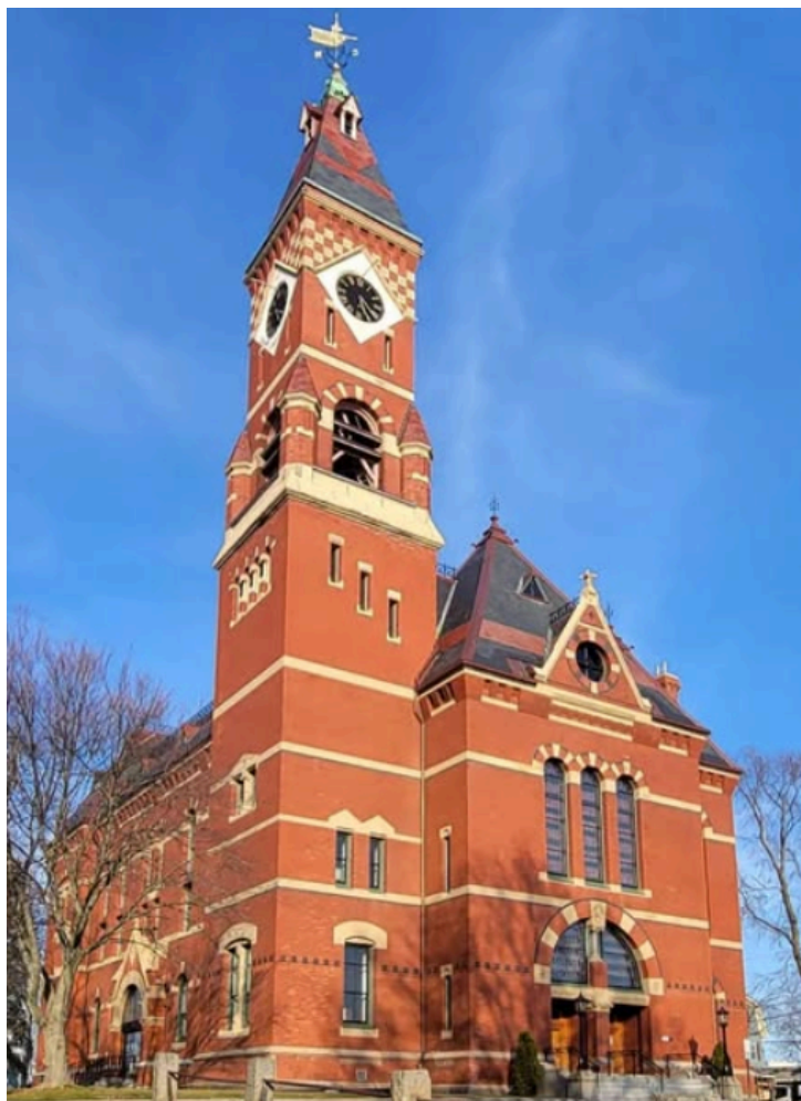
Abbot Hall in Marblehead is heated and cooled by geothermal energy.

The Ultimate Toolkit for Reducing Energy and Enhancing Efficiency in Your Home